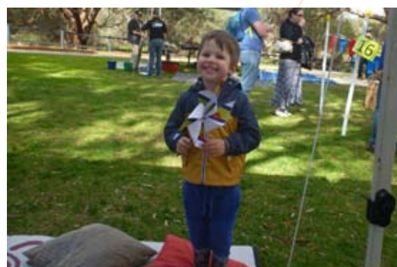
Making pinwheels and meeting worms at the Wired for Science expo in August